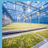
Improving Food Production