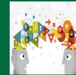
Science Communication and Public Engagement