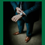
Tackling the Scale-up Challenge