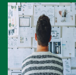
IP Management in the Food Sector