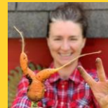
From Waste to Value