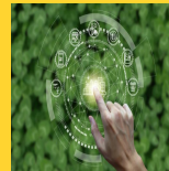
Sustainable Urban Food Systems